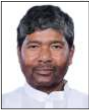
Shri Pashupati Kumar Paras

Hon'ble Minister, Food Processing Industries, Govt. of India