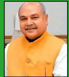
Shri Narendra Singh Tomar Hon'ble Minister of Agriculture & Farmers Welfare, GoI