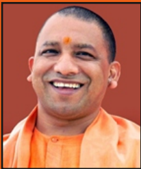
Yogi Adityanath Hon'ble Chief Minister, Uttar Pradesh